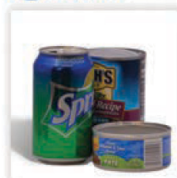
Aluminum and Steel Cans empty and rinse