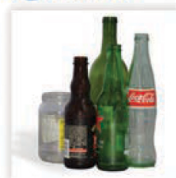
Bottles and Jars empty and rinse