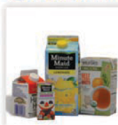
Food and Beverage Cartons empty and replace cap