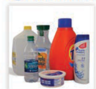
Kitchen, Laundry, Bath: Bottles and Containers empty and replace cap